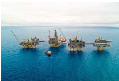
350,000 documents form the basis for the digital twin of the Johan Sverdrup offshore platform. Engineering Base enables Equinor to transform the documents into highly digital, centrally managed lifecycle data.

Aucotec won a very special contract last year: an offshore project of Equinor, the oil drilling platform Johan Sverdrup.